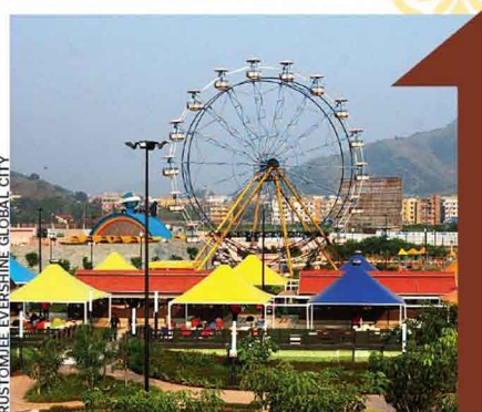
RUSTOMJEE EVERSHINE GLOBAL CITY