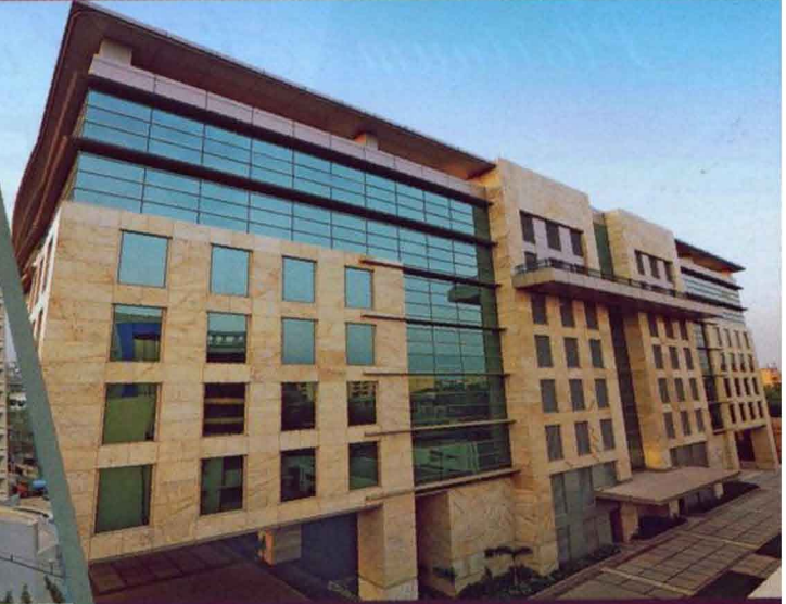
Kalpataru Square, Mumbai

also Mumbai's first residential project where the first liveable floor began from the 14 th floor. Both towers have a swimming pool on the rooftop and every apartment has a sea view. Also, our commercial project Kalpataru Square in Andheri (East), Mumbai, is the first building in Asia and the sixth worldwide to receive the LEED (C&S) v20 platinum certification by the US Green Building Council. Similarly, Kalpataru Habitat in Parel, Mumbai, has an independent car parking building and sports facilities like golf, basketball and a tennis court atop the building, again a first-of-its-kind.