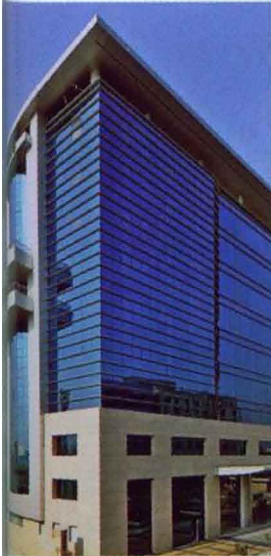
Kalpataru Synergy, Mumbai