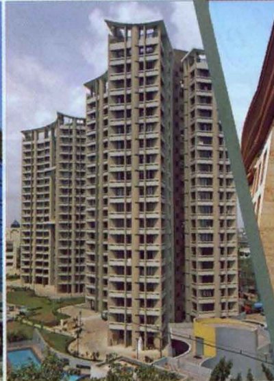
Kalpataru Residency, Mumbai